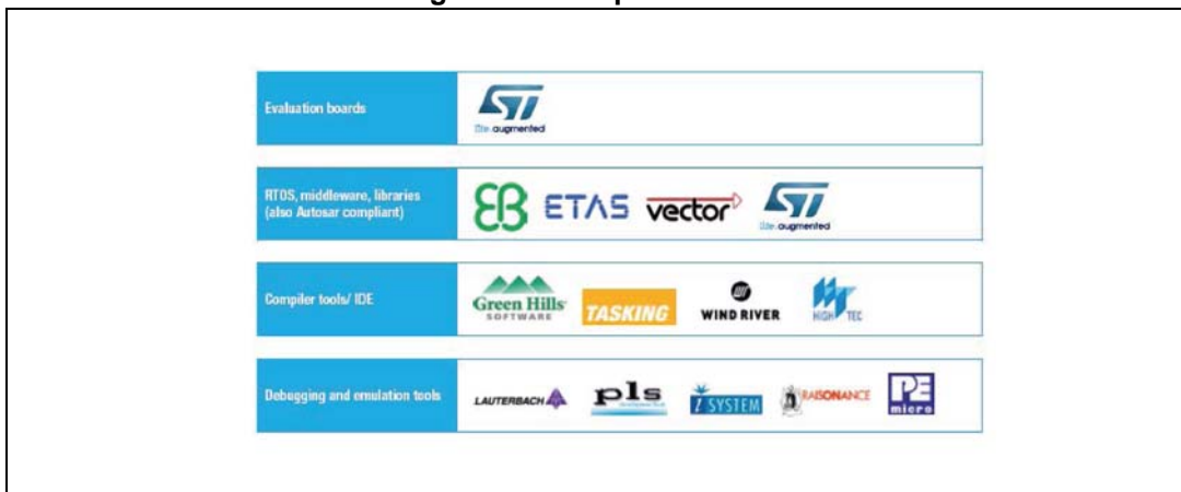
Figure 2. Third parties tools

A set of ST and third parties tools are available to explore the product family starting from budgetary cost evaluation boards to top class solutions.